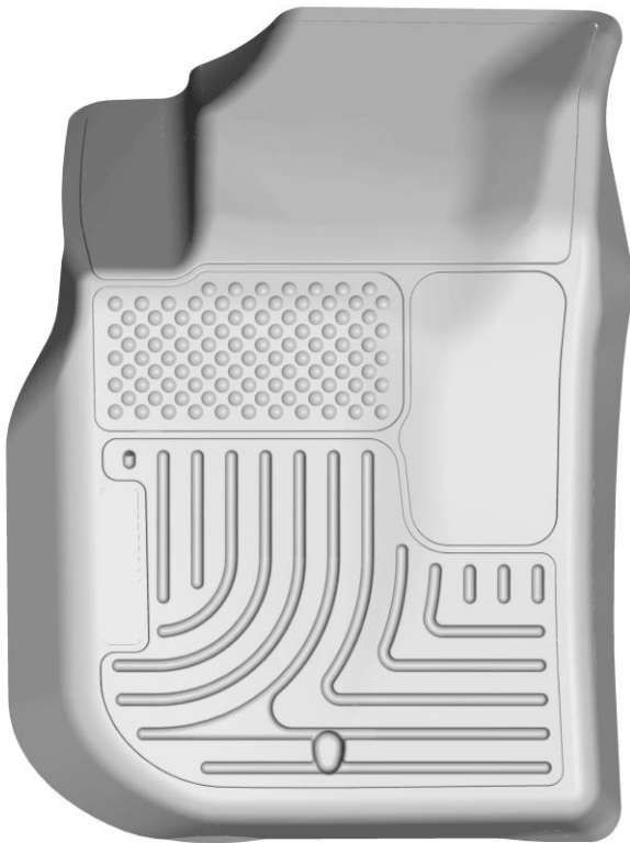
LEFT OR DRIVER'S SIDE